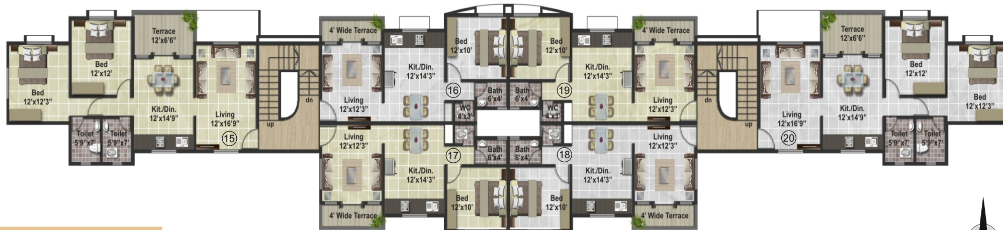
Third Floor Plan :